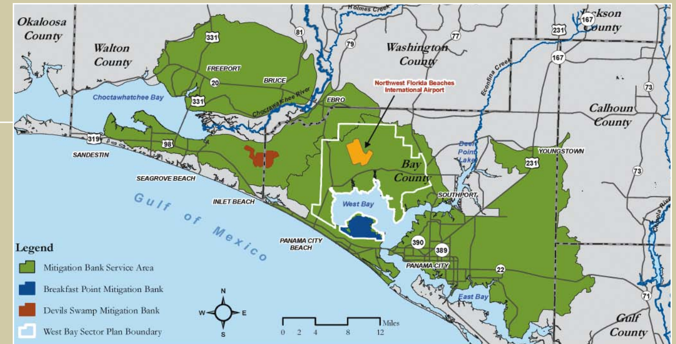
Permitted in 2004 with operational efforts beginning in 2006, JOE's Breakfast Point Mitigation Bank and Devil's Swamp Mitigation Bank are located in Bay and Walton Counties.