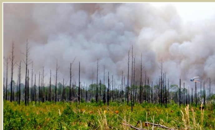
Tree thinning and prescribed burns are mitigation techniques used in Mitigation Banks to restore and maintain ecological value.

Through its rules, the U.S. Army Corps of Engineers has established a preference for mitigation bank credits. Mitigation Banks are a more comprehensive approach to restoring an environmentally sensitive area.