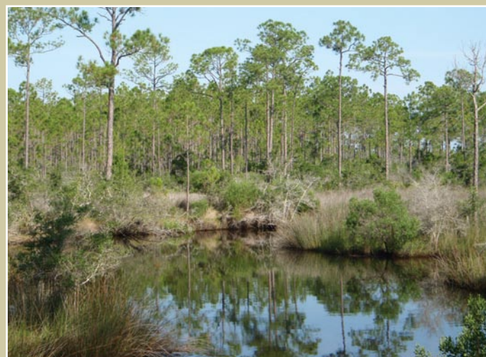
Restoration work at Breakfast Point, a mix of salt and freshwater habitats, will benefit the St. Andrews Bay watershed.